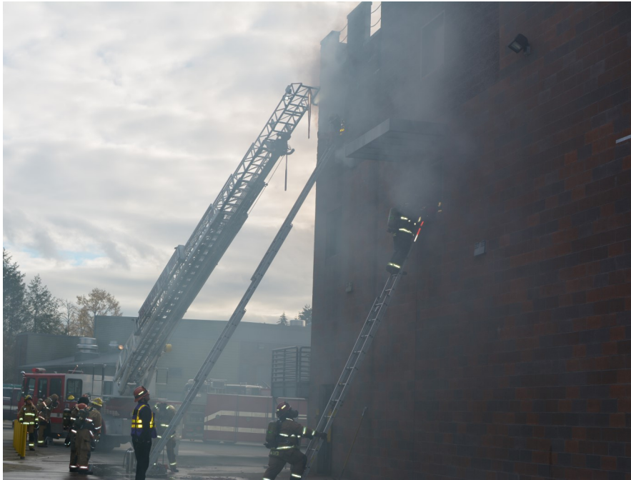
Northshore Fire will train often with other local fire departments, utilizing our training tower at Station 51 in Kenmore.